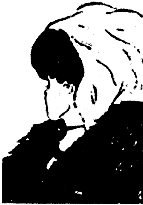
FIGURE 11.2. This ambiguous figure is called "My wife and mother-in-law" and is constructed from overlapping unambiguous elements. The perceptual system tends to group like or related information together. Rather than presenting some odd mixture of the two alternative pictures, partial identification of a young woman or an old woman in this figure supports a stable perception of a single coherent image. The identification of wholes and of parts is reciprocally supportive, contributing further to the locking-in process. A shift in gaze is not necessary for a perceptual change to occur. In what may be analogous to discrete emotional feelings' being spawned by the same ambiguous pattern of somatovisceral information, ambiguous visual figures demonstrate that discrete images can derive from the same ambiguous pattern of visual information. From Boring (1930).

visceral attributes. Thus several important features required for the production of somatovisceral illusions are plausibly in place.